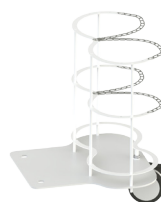
Cylinders Holder (WLB-1060)