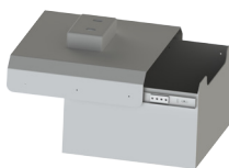
Storage Drawer (WLB-1050)